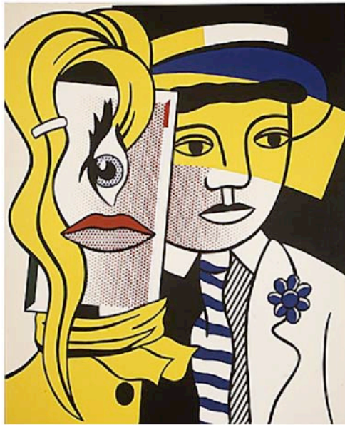
Stepping Out Roy Lichtenstein 1978

Every year, 1.5 million Americans are injured by preventable medication errors, according to the Institute of Medicine. A doctor's bad handwriting can be harmful to patients — they can end up with the wrong medication or a mistake in the dosage. For example, a child gets 10 milligrams instead of 1. Enter Allscripts, a Chicago-based healthcare technology company. Through electronic prescribing and medical-record software, they remove error from the process. While not necessarily saving doctors time, it might save patients' lives. Some 50,000 doctors currently use the software.